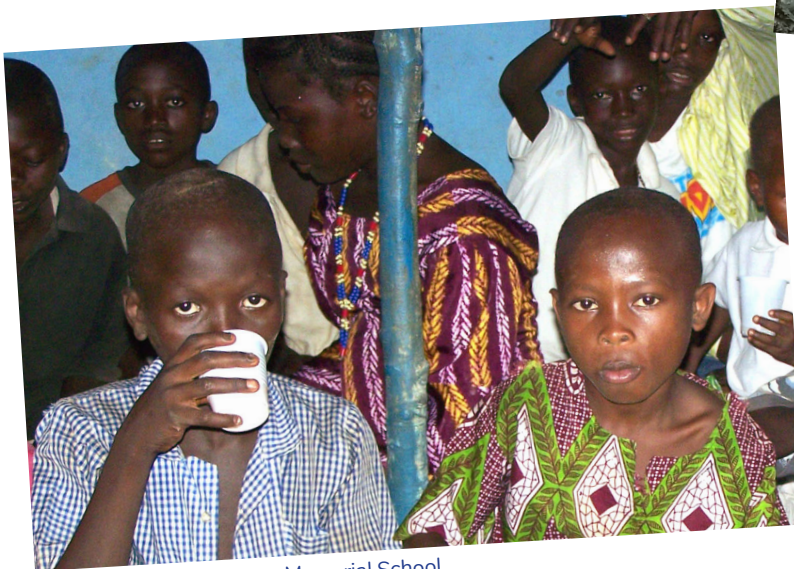
Students from Judy Zinser Memorial School